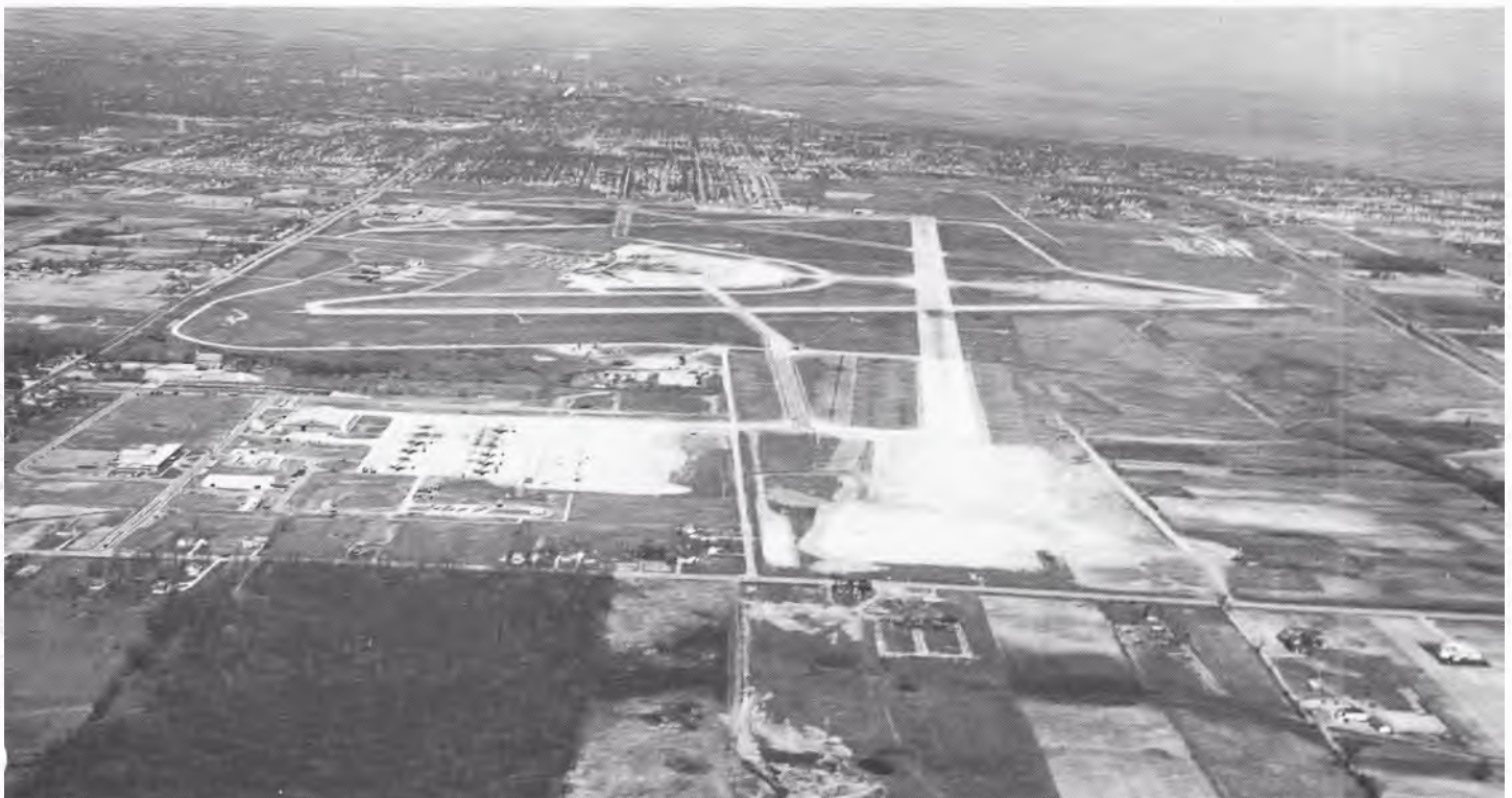
This 1959 photo shows the extent of runway expansion at Mitchell Field. The north-south runway, shown just to the right of the Howell Avenue terminal complex (center of photo) has just been lengthened to 8,470 feet. A 1960 addition would expand it to its present length of 9,920 feet. Running across the center of the photo, the northeast-southwest runway is shown at its original length of 5,600 feet.

Earlier this year, the firm presented several different recommendations for an additional runway to accommodate increasing airliner takeoffs and landings and prevent long delays. Because of the close proximity of neighborhoods in virtually every direction, airport planners face a dilemma no matter which option is chosen. In an attempt to be sensitive to the concerns of everyone involved, airport officials have scheduled frequent meetings in all of the surrounding communities, with experts on hand to explain the possible options available and their effect on both the airport and its neighbors. Officials also created a