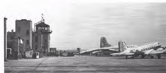
In the mid- to late-1940s, when this photo was taken, the terminal and runway configuration at Mitchell Field was already beginning to show signs of inadequacy, although this scene shows a relatively slack period. Aircraft shown are a Northwest Airlines DC-4 (center), flanked by a Capital Airlines DC-3 and a Northwest DC-3.

Prior to 1950, most of the land surrounding the airport was zoned for agriculture, which meant that airport expansion had an impact on far fewer families than a residentially zoned area. Secondly, because the tax infrastructure of a city placed a far greater burden on farmers than that of a township, many farms were going up for sale to developers eager to subdivide the land. This placed pressure on cities which now had to decide how the lands in question should be zoned. Within a year of the new terminal's opening, controversy between the County Board, the developers, and the City of Milwaukee was already taking place. Ironically, all this trouble was beginning just as the airport was beginning to become profitable — in 1955, for the first time in its 30-year history, the county's main airport had an operating income above operating expenses, netting $136,600. For the fiscal year ending June 30, 1954, Mitchell enplaned and deplaned 208,000 passengers - 25th among large American cities. County and airport officials realized, however, that in order to accommodate growing air passenger traffic and to remain profitable in future years, allowances for expansion would have to somehow be negotiated.