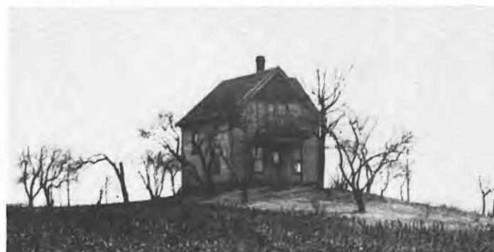
The Lupo homestead as it appeared prior to its remodeling in 1940. The camera looks southeast.

Plans for refurbishing, cleaning, and exhibits are to take place at this meeting in addition to regular business, so let's try to make this our first 100% membership meeting ever — see you there!!!