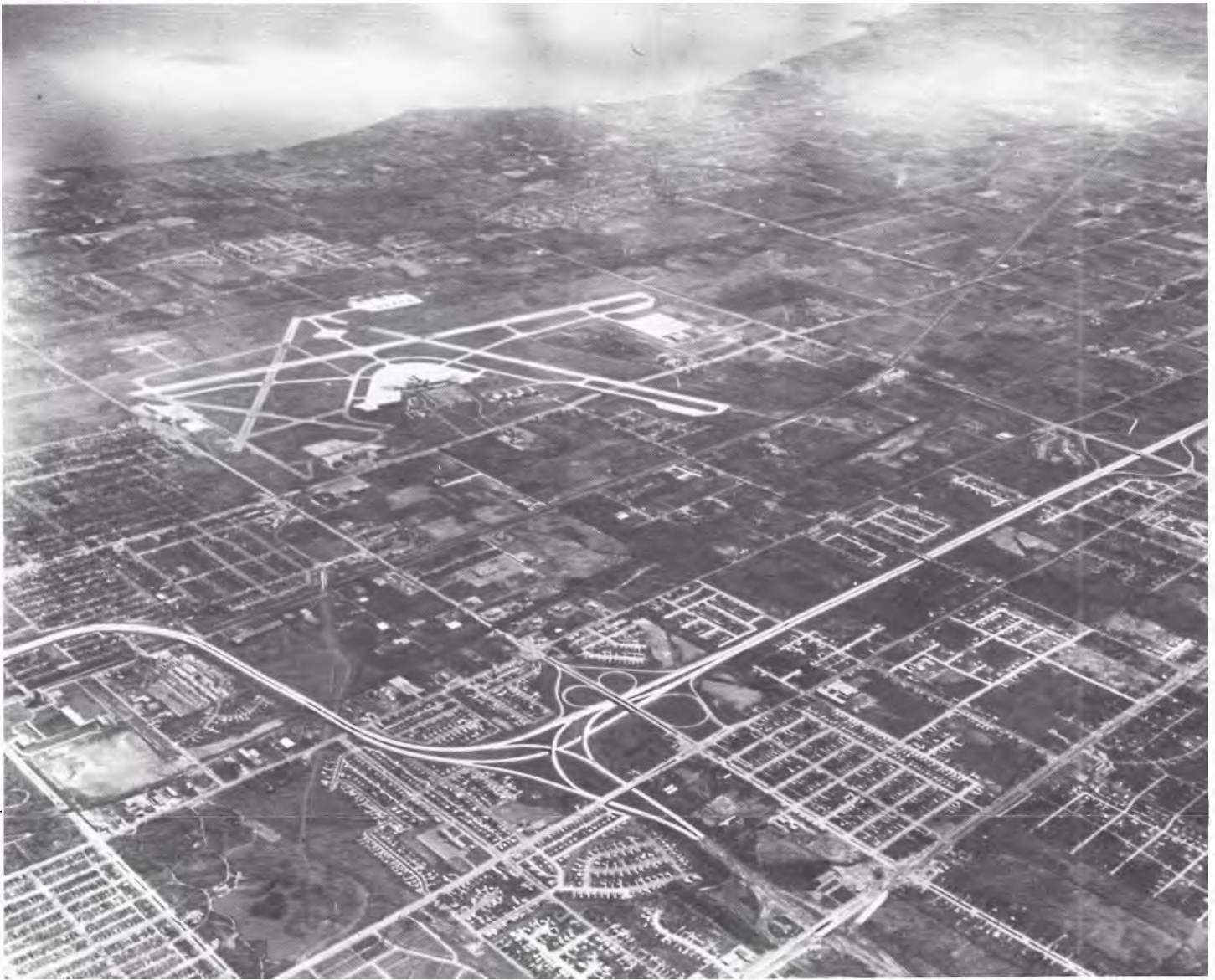
This dramatic 1966 aerial photo, looking northeast, clearly shows the conflict of airport expansion versus neighborhood destruction. The subdivision adjacent to the Howell Avenue runway extension was wiped out by the construction of the Airport Freeway Spur in the late 1970s. A subdivision west of Howell Avenue and north of College Avenue is now threatened by the possible construction of an additional, parallel northeast-southwest runway within the next ten years.