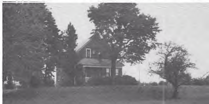
The same view showing the brick siding and remodeled front porch, August 19, 1990.