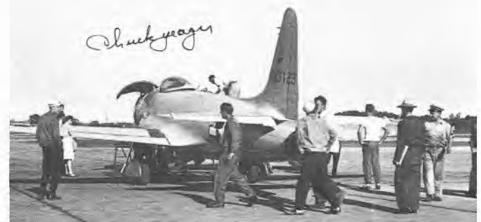
Although the commercial jet age would not arrive in Milwaukee for another 16 years, the excitement in these area aviation buffs is evident in 1945 as they examine the first jet-powered aircraft ever to land in Milwaukee County, a P-80 jet fighter piloted by USAAF Captain Chuck Yeager, who would not achieve supersonic fame in his Bell X-1 until two years later.

At one point, the district engineer for the Federal Aviation Agency urged the County Board to discourage or prohibit the use of land one-half mile on either side of, and three miles beyond the end of runways and approaches used by jet aircraft for homes, schools, hospitals or other places of public assembly, to minimize the noise nuisance created by jet planes. The county complained that it "had no